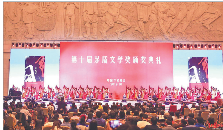
The 10th Mao Dun Literature Prize award ceremony was held in Oct 2019.

The award ceremony for the 11th Mao Dun Literature Prize will be held in mid-November in Tongxiang, Zhejiang, the hometown of Mao Dun.